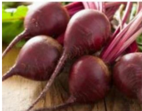
Beetroot with Leaves