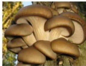
Mushroom - Oyster