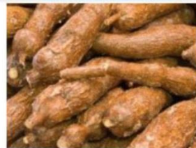
Manioc / Tapioca