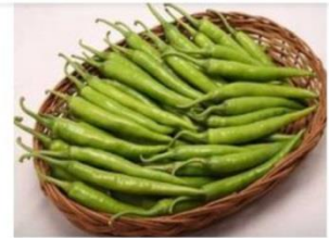
Chillies – Green