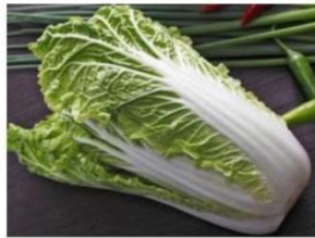
Cabbage – Chinese