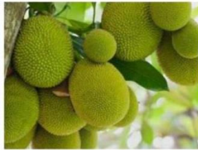
Polos / Baby Jak