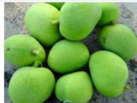
Mango - Green/Raw