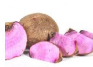
Purple Yam / Raja Ala