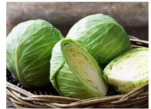
Cabbage – White