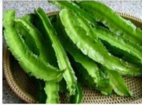
Dambala / Winged Beans