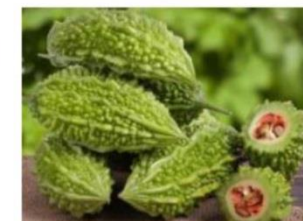
Bitter Gourd / Karawila