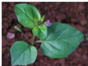
Horse Purslane / Sarana