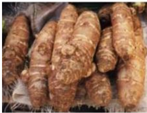
Kukul Ala Yam