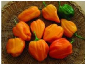
Chillies – Hot / Scotch Bonnet