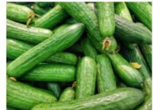
Cucumber – Japanese (G/H)