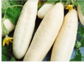
Cucumber – White