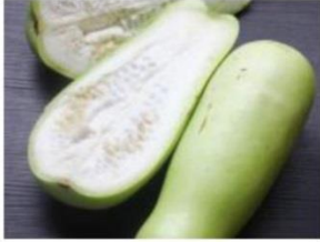
Bottle Gourd / Labu