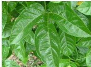
Passion Fruit Leaves