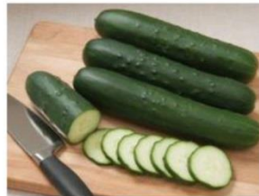
Cucumber – Green