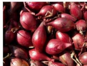
Onion - Red