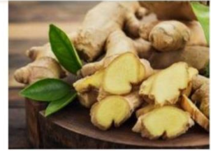
Ginger – Large