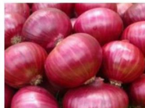
Onion - Big