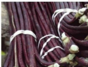
Long Beans - Red