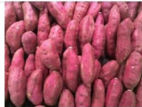
Sweet Potatoes / Bathala