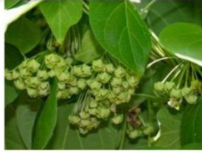
Green Milkweed Climber / Anguna Kola