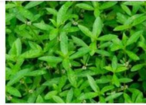
Sessile joyweed / Mukunuwenna (MK)