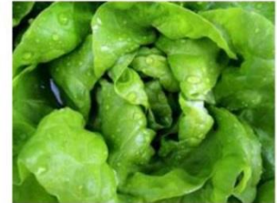
Lettuce - Green