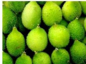
Spine Gourd / Thumba