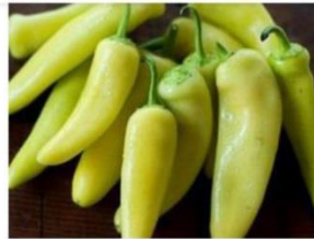
Chillies – Capsicum