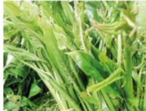
Lasia Shoots / Kohila Dalu