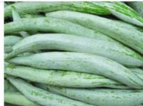
Snake Gourd / Pathola