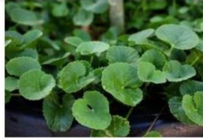
Pennywort / Gotukola (GK)