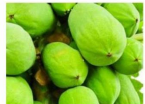
Papaya - Green/Raw