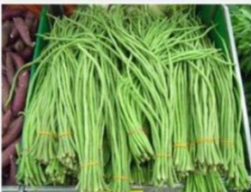
Long Beans - Green