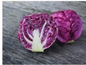
Cabbage – Red