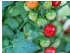
Tomatoes - Cherry