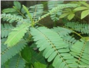
Hummingbird tree / Kathurumurunga (KM)