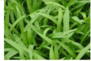
Water spinach / Kang Kung (KK)