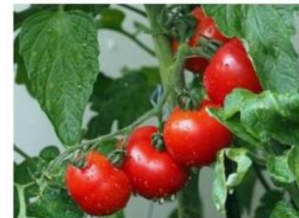
Tomatoes - Large (G/H)