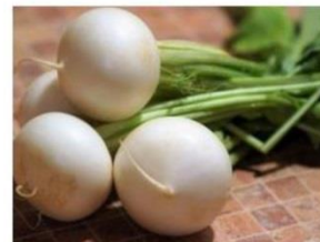
Radish – White