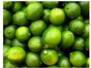
Limes - Green