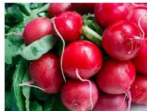
Radish – Red