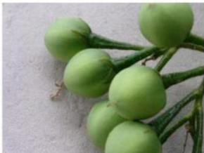
Turkey berry / Thib-