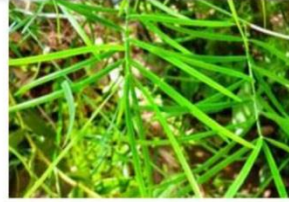
Asparagus racemosus / Hathawariya