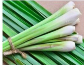
Lemon Grass / Sera