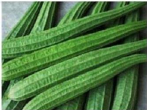
Ridge Gourd / Luffa / Watakolu