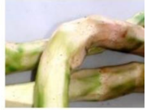
Lasia Stalk / Kohila Ala