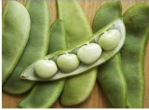
Leema Beans / Avara