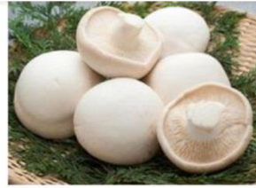
Mushroom - Ablone