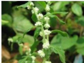
Aerva lanata / Pol Pala