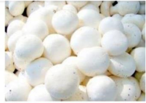
Mushroom - Button