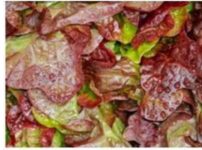
Lettuce - Red