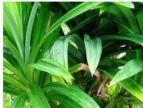
Pandan leaf / Rampe