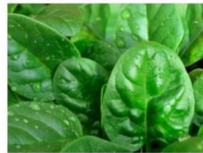
Malabar Spinach /